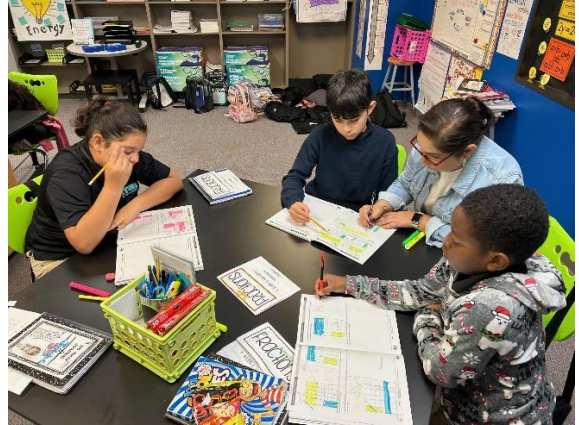
Coaching moves from conversation into practice, a teacher works alongside students, putting instructional strategies to work in real time.

Her principal is overwhelmed. Professional development comes once a year in a large auditorium. She has never had a coach. Someone who watches her teach, asks the right questions, and helps her grow. So each year, the gap between what she gives and what she receives widens. And one day, the math stops working.